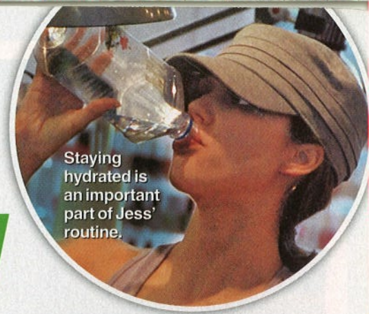
Staying hydrated is an important part of Jess' routine.